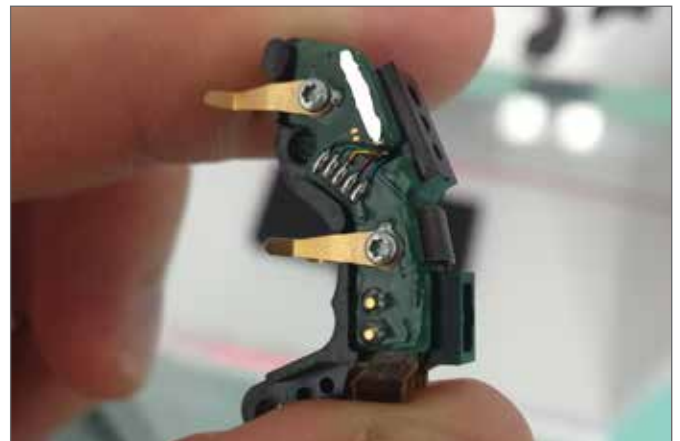
Application in cochlea-implantat-system (hearing aid for deaf)