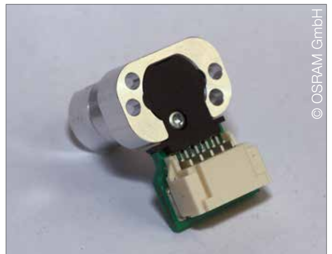
Application in miniaturized laser activated remote-phosphorus-device \mu LARP (laser light for cars)

Due to the thread-forming geometry of the EJOT® Micro Screws, inserts are unnecessary even for highly stressed components. Preparatory steps, such as thread cutting, which are especially difficult in the micro range can be omitted when using the EJOT® Micro Screws. Due to their individual thread geometries, adapted to the used materials, they are suitable for many different materials. They are also a good substitute for soldering, gluing, clipping or welding, because of their removability.