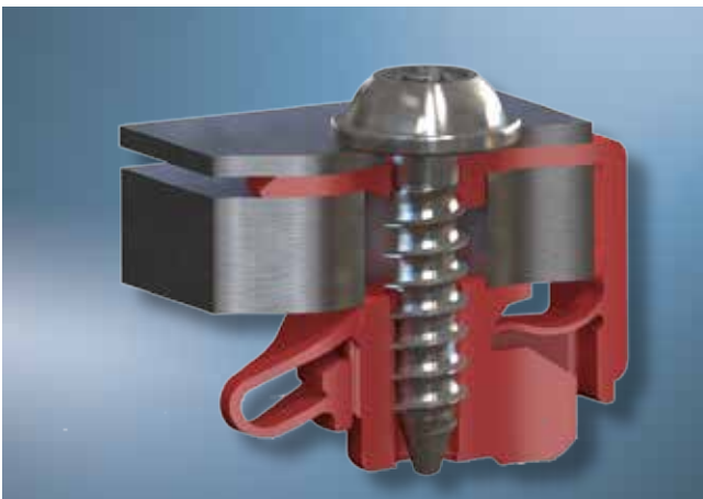
EASYboss® V functionality for various clamp thicknesses

With the EJOT EASYboss® V cost saving potentials can be realised through standardisation.